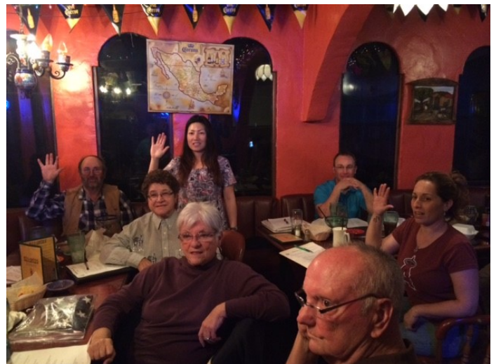
New Corral 22 Board of Officers being sworn in to office